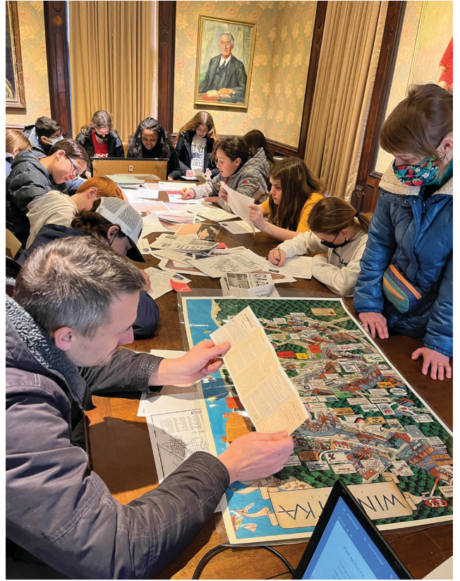
North Shore Country Day School students at the WHS museum (411 Linden St.).