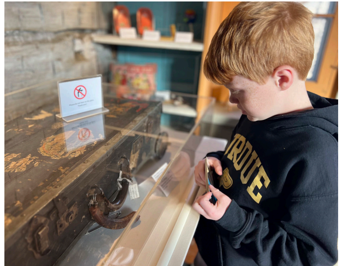
Student investigates artifacts on a school field trip to the Schmidt-Burnham Log House.

The Winnetka Historical Society honors and preserves the village's heritage, gathers and shares the artifacts and stories of its past, and fosters meaningful connections among Winnetkans and the broader community.